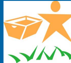
Housewarming Baskets & Home Visitors Program