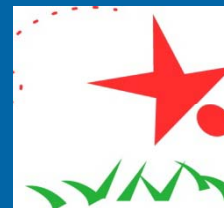
Be Cool – Summer event