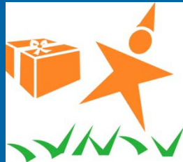
Fostering Success Grants